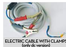
ELECTRIC CABLE WITH CLAMPS (only dc version)