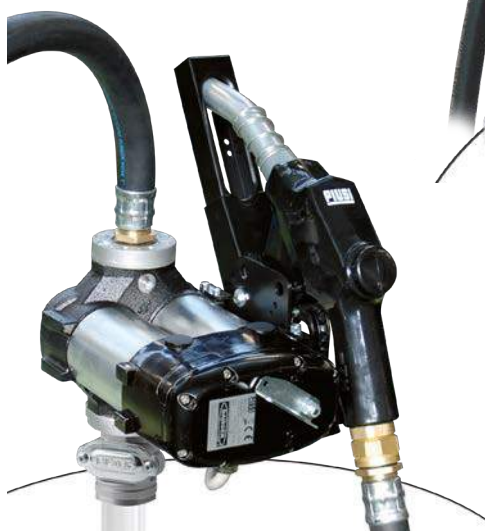
DRUM BI-PUMP 12V