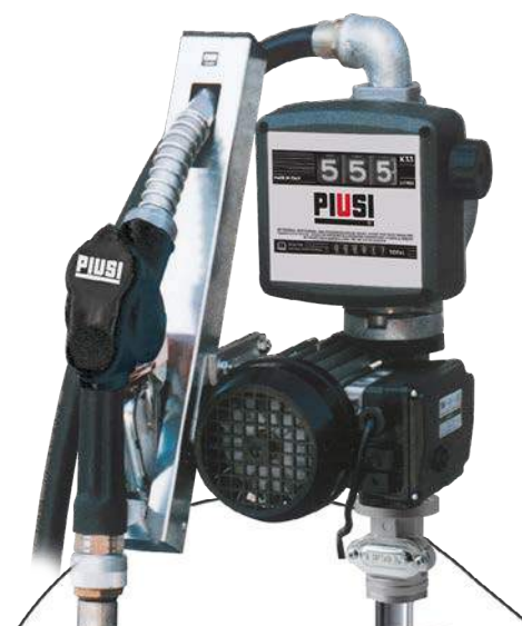
DRUM PANTHER 56 K33