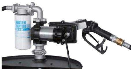
DRUM EX50 WITH AUTOMATIC NOZZLE