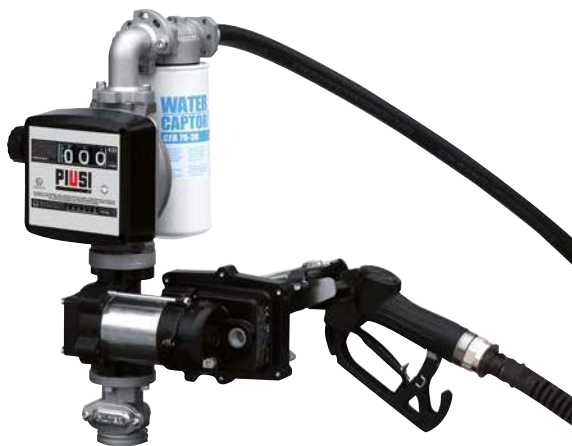
PIUSI DRUM EX50 WITH METER AND FILTER

The PIUSI EX50 DRUM is a complete pump transfer kit expressly engineered for ATEX/IECEx areas. This system is composed of a high-efficiency pump, manual or automatic nozzle and a telescopic suction hose. Thanks to the flanged components, this transfer set allows users to replace any component without using sealants thus creating maximum versatility and adaptability to any kind of condition. K33 mechanical meter available on request.