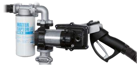
DRUM EX50 WITH MANUAL NOZZLE

OUR PUMPS COMPLIES WITH THE FOLLOWING MARKING ATEX/IECEx